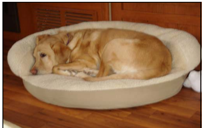
All of this activity makes a girl tired!

If she could talk, she could tell you everything that is happening around the camper. Abbey thinks camping is a social event. When she is inside the camper, she is usually at one of the windows watching something or someone. When someone walks by, she stands at the window wagging her tail knowing there is a good chance they are going to come to the window to talk to her.