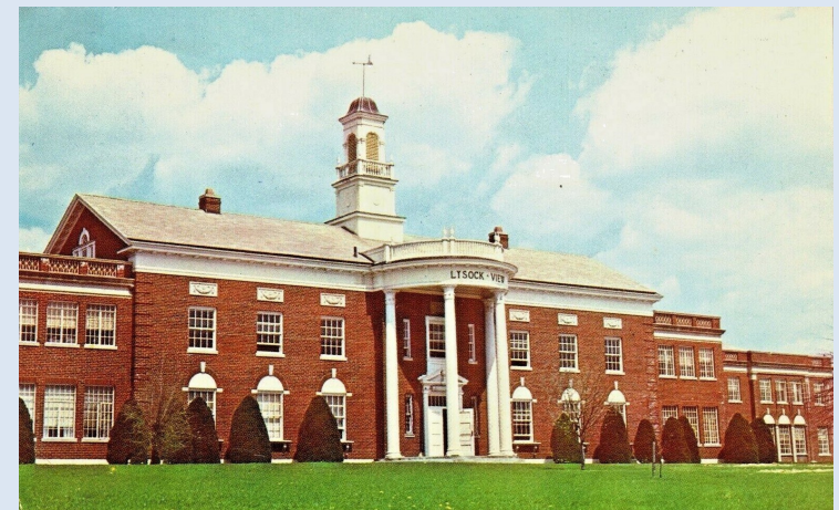
Lycoming County Department of Public Safety 542 County Farm Road