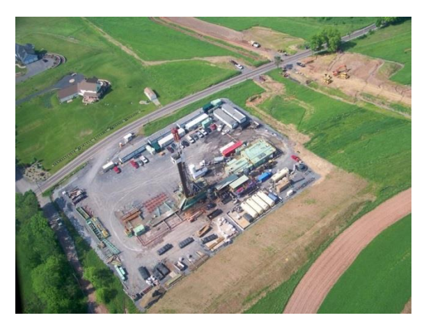
Natural Gas Well Pad, Cogan House Township

Return of Natural Gas Development When the 2006 County Comprehensive Plan was adopted, the natural gas industry was long aware of the gas in the Marcellus Shale Formation; however, they viewed the formation to have inconsequential natural gas potential due to the presence of low permeability shale. In 2003 Range Resources unsuccessfully drilled a well into the Oriskany Sandstone Formation but through doing so discovered that Marcellus Shale had some of the same properties of the Barnett Stale Formation in North Texas. In order to salvage their investment, Range Resources successfully completed the well in the Marcellus Formation utilizing hydralic facturing