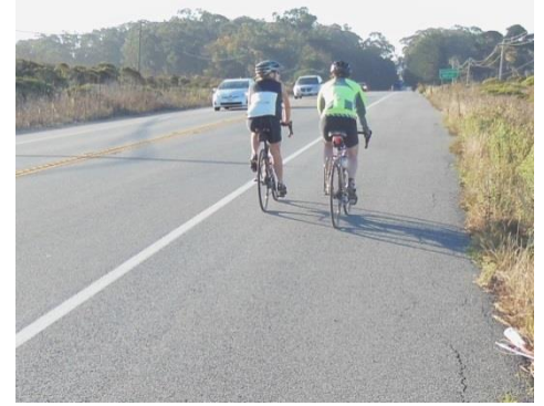
Wide shoulders allow cyclists to travel outside of the main travel lane.

neighborhoods and communities together as well as providing access to local amenities such as parks, schools, and libraries. Equally important are the improvements to neighborhood walkability. At the larger scale, improvements may need to be made to primary routes throughout the County to make them safer for pedestrians and cyclists. These improvements should be targeted along collectors and arterial roadways as these roadways usually provide the best connectivity but also the greatest risk of accidents. Roadway designs could include narrower lanes, lower speed limits, and clearly marked bicycle lanes or wide shoulders for cyclists. The County will work with PennDOT and our municipalities to emphasize the importance of these facilities when roads are being re-designed or renovated.