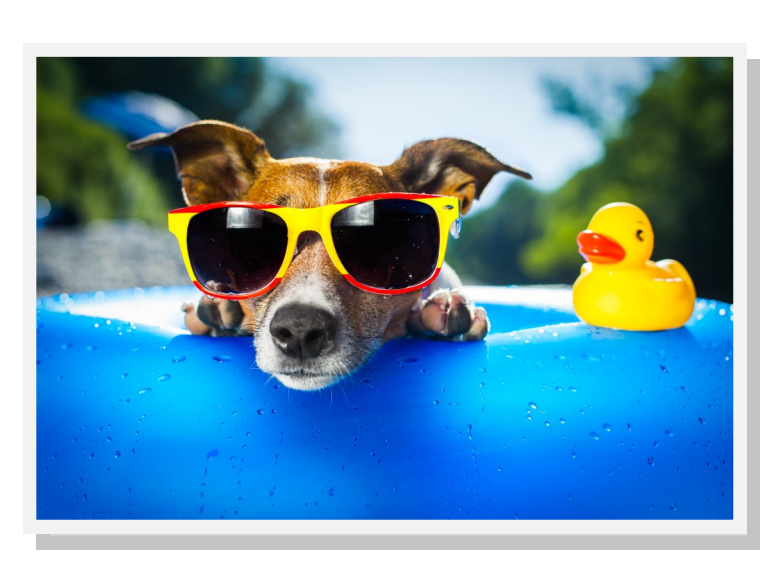
Stay cool this summer & enjoy the weather!

Contact the Controllers Office at: 570-327- 2295