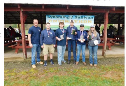
Lycoming Sullivan Envirothon Top Overall Team Montoursville Team D

The Annual LCCD Environmental Education Mini Grant Program funded 5 projects for a total of $8242. Jersey Shore Outdoor Club, Lewis Township, Northcentral Pa Conservancy, Camp Susque and Lycoming College Clean Water Institute.