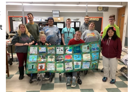
National Trout In the Classroom Quilt Project Jersey Shore Life Skills Class