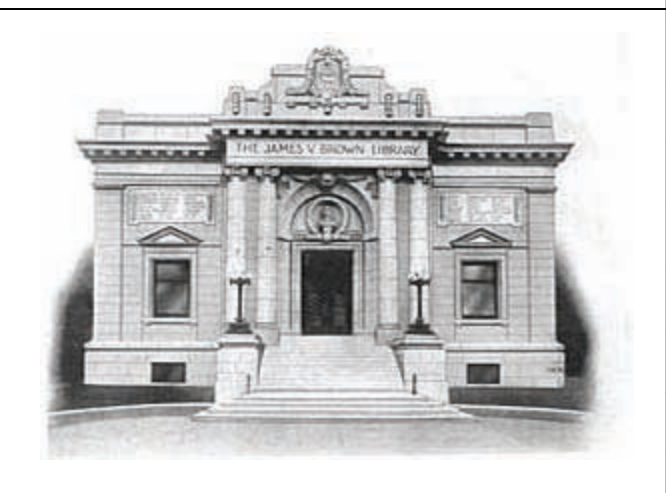
J. V. Brown Library, 19 East Fourth Street, Williamsport

(http://www.va.gov/healtheligibility/application/VIC.asp)