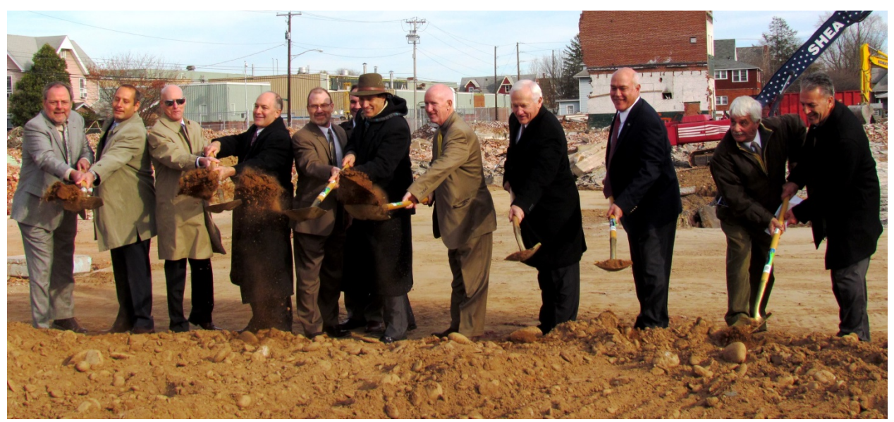
WILLIAMSPORT — WNEP-TV. A groundbreaking ceremony was held Thursday (November 14<sup>th</sup>) on a housing development at the former Brodart warehouse site in Williamsport. Memorial Homes will be a three-phase housing development with 74 properties, including apartments, townhouses, and single-family homes. Construction should take a year. Money collected from the gas impact fee in Lycoming County is helping to pay for the project.