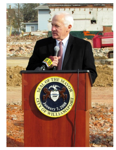
Senator Gene Yaw 23<sup>rd</sup> Senatorial District