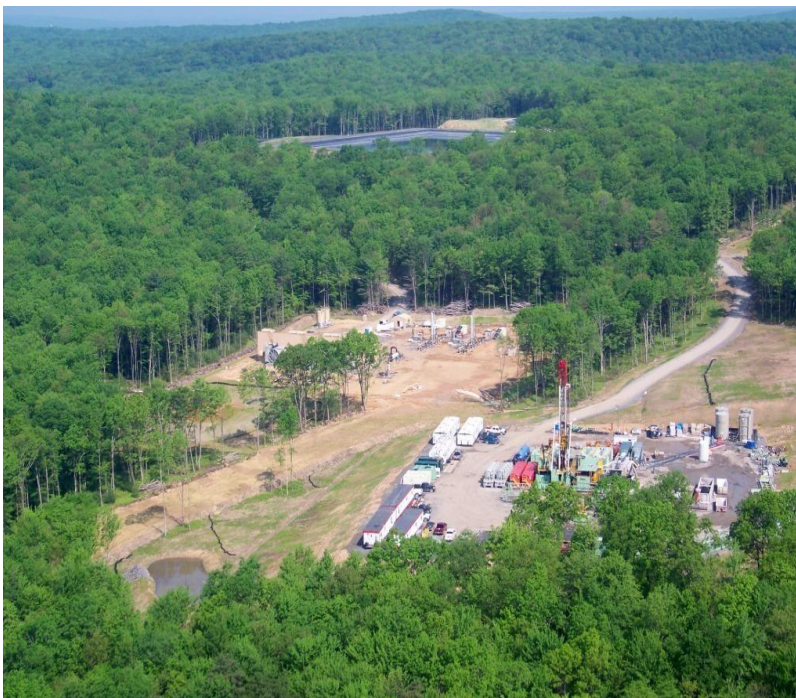
Non-Conventional Natural Gas Development in Lycoming County

Figure 3 depicts some of the types of intensive development where contamination is possible including a natural gas drilling pad, compressor station, water impoundment and access roads.