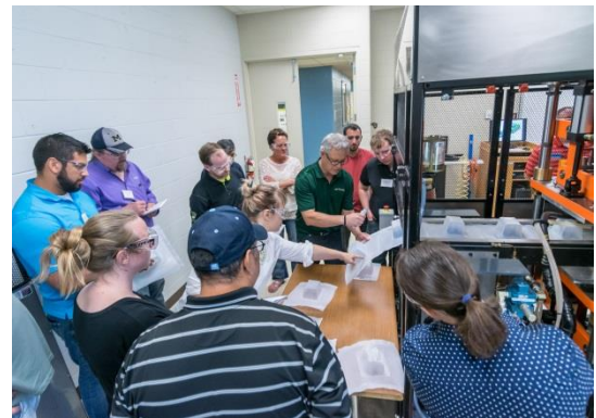
Penn College of Technology Students at Plastics Innovation & Resource Center workshop

In addition, Lycoming County is located in close proximity to the new ethane cracker facility to be built in Beaver County, Pennsylvania. While there are existing petrochemical production and plastic manufacturers in the State that will benefit from this, there is an opportunity for new growth because of the close proximity to the feedstock used by these industries and the potential supply of this feedstock. These facilities utilize the by-products of natural gas extraction to produce the materials needed for plastics production. The County has an opportunity to leverage this linkage to expand new job growth, build off its manufacturing base, and diversify its economy.